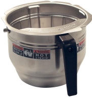
FUNNEL AY,W/DECAL GRT "C"7.62