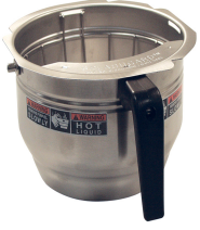
FUNNEL AY,W/DECAL GRT "C"7.12